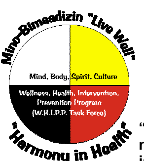
W.H.I.P.P. (Wellness, Health, Intervention, Prevention, Program) Task Force