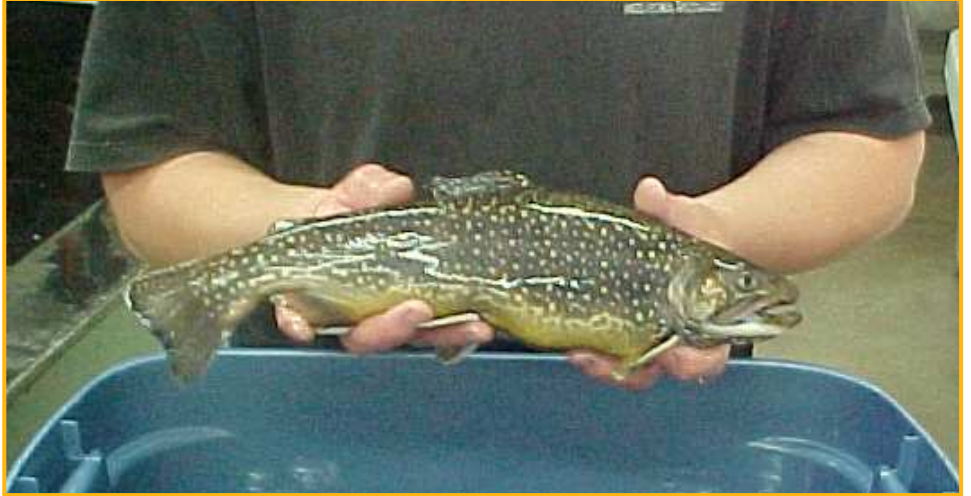
A typical Jumbo River brook trout brood stock held at the KBIC Hatchery.