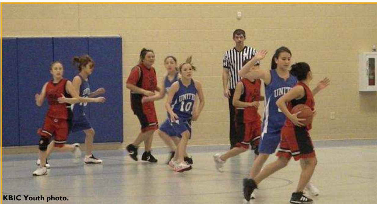
KBIC Youth photo.