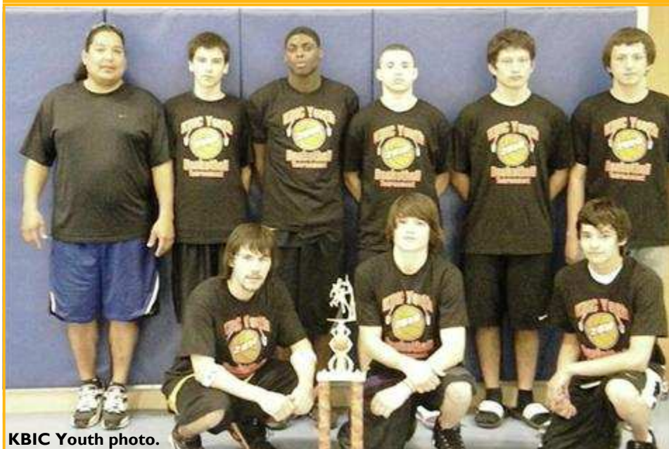
KBIC Youth photo.