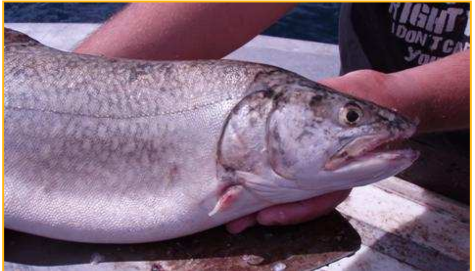
A very large lake trout captured in Keweenaw Bay that is fin-clipped, indicating it came from the KBIC Hatchery Program.

Brook Trout: The brook trout strain reared at the Pequaming hatchery originates from brook trout populations in the Jumbo River system in the Ottawa National Forest. This Jumbo River brook trout is one of the few native Lake Superior basin brook trout strains being reared and stocked in the Lake Superior basin. Ottawa National Forest worked with the hatchery to develop this strain.