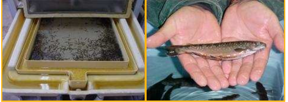
Newly hatched brook trout fry (above left) and yearling brook trout (above right) at the KBIC Hatchery.

Fish Health: Every year the Tribe's hatchery facility, located in Pequaming, receives a full disease screening by the Fish and Wildlife Service-LaCrosse Fish Health Center, and since inception in 1993, the facility has been certified as disease free. Quality fish health is critical to putting out a quality fish stock, and good fish health is a direct result of staff performance. The recent discovery of VHS virus in this area of Lake Superior has increased everyone's general awareness about the threat and potential impact of wildlife diseases, but disease and cleanliness are always concerns in a hatchery.