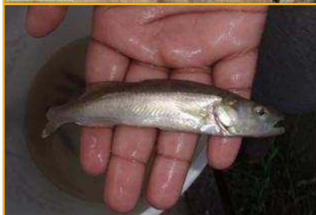
Layout of the KBIC Walleye Rearing Ponds (Top photo), and a product of KBIC Walleye rearing efforts in 2009, (Lower photo).

If you have any questions, or would like a tour of the Tribe's hatchery facility, you can call them at (906) 524-5757.