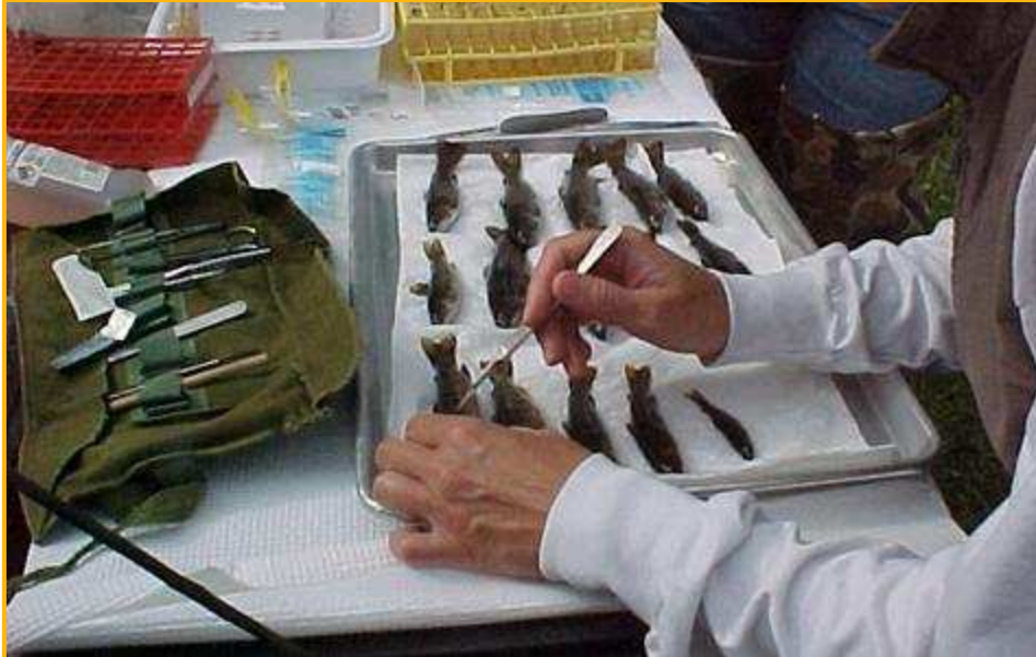
USFWS Staff work with KBIC in testing hatchery fish for disease on a regular basis.