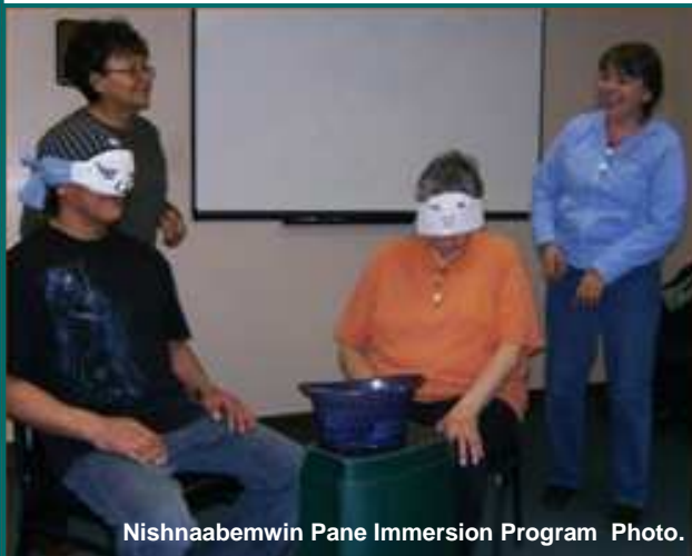
Nishnaabemwin Pane Immersion Program Photo.

It is recommended to sign up in early April. Contact Gary Loonsfoot, Jr., Language Coordinator, for an application. Gary can be reached by calling 353-4178. Students may also sign up on the first day of class.