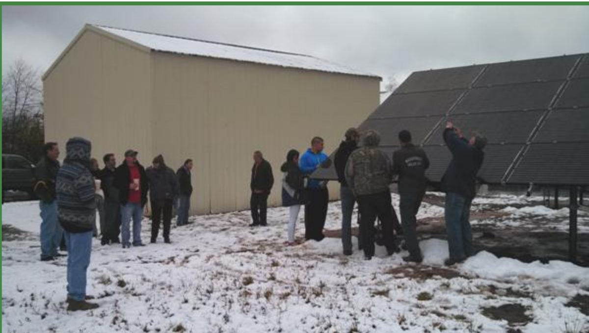
Above, L'Anse/Baraga High School students assist with installing the last solar panel. Our youth were included because it is their project and reminding them that this is their system and to take care of it.