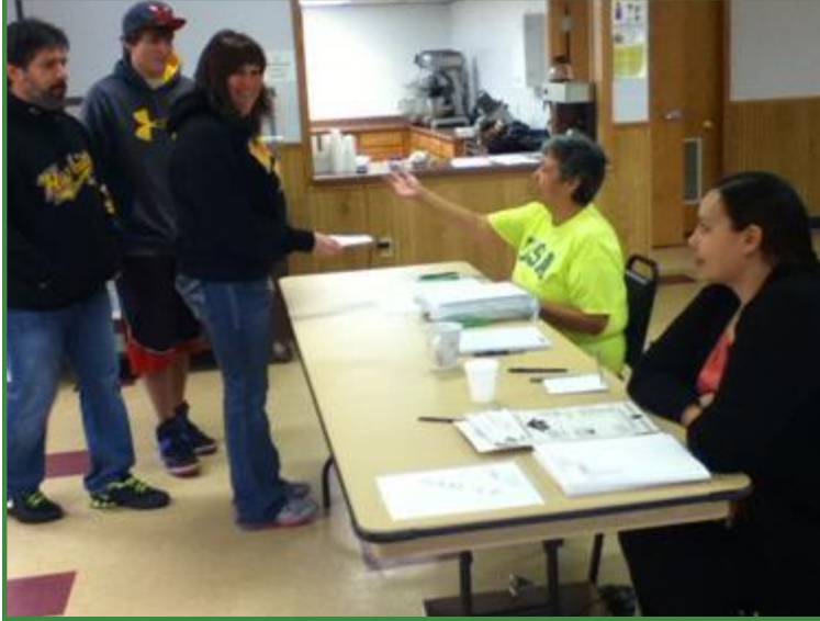
Baraga District Voters, November 2, 2013