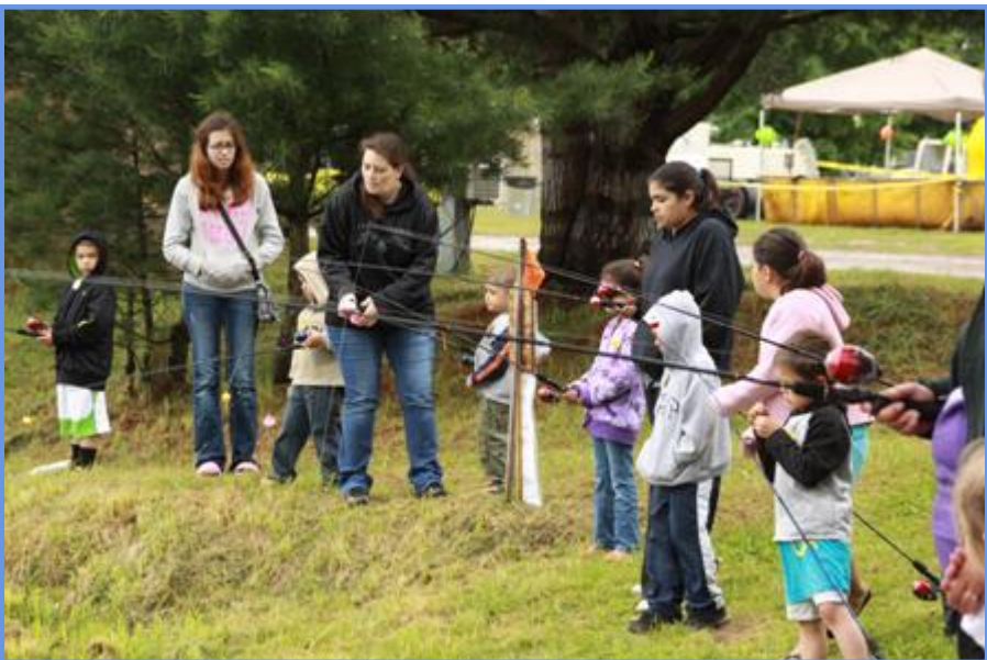
(Above) A bunch of Fisher-Kids working together to not get tangled! (Below) Kids enjoy a canoe ride around the shorelines.