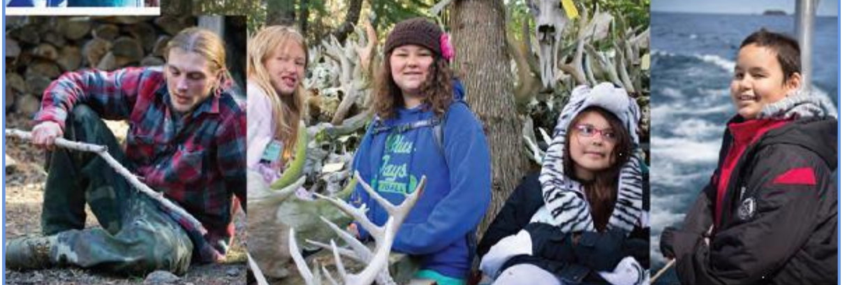
Pictures and article compliments of Jon Magnuson, The Cedar Tree Institute.