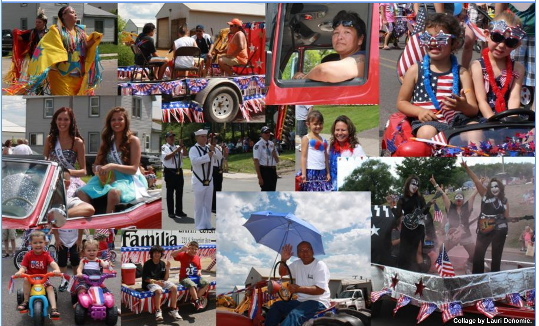
Collage by Lauri Denomie.