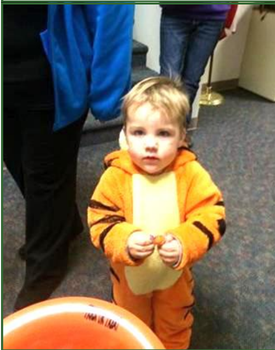
KBIC Headstart/Early Headstart students visited the Tribal Center on Thursday, October 30th to treat or treat. Tribal Center staff always look forward to this annual field trip as well.