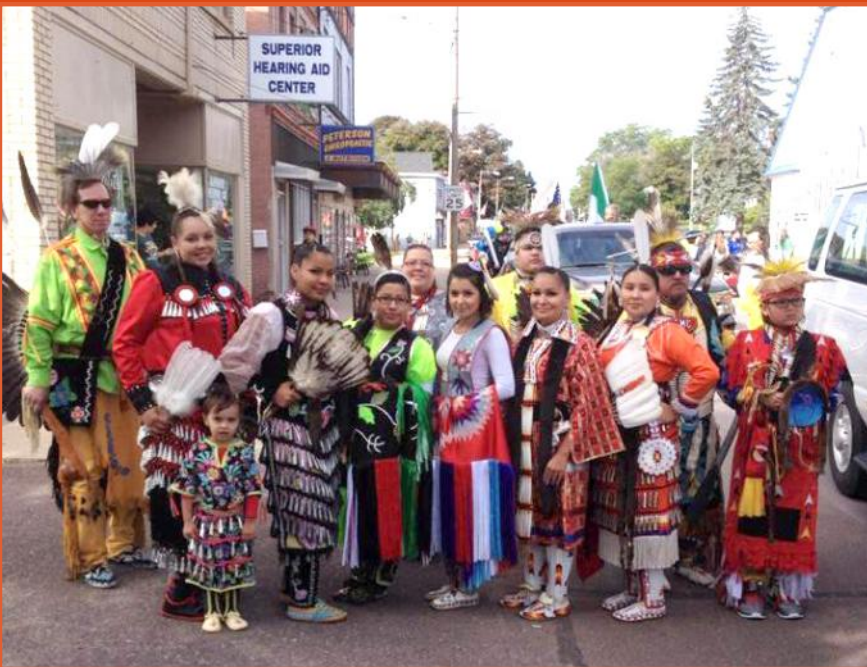
KBIC Dance Troupe at Parade of Nations 2014.

The KBIC Dance Troupe participated in the Parade of Nations held in Houghton, Michigan, on Saturday, September 13, 2014. The KBIC Honor Guard led the ten member dance troupe in the Parade of Nations who were accompanied by the Woodland Singers. The theme for this year's Parade of Nations and Multicultural Festival was "Around the World in 25 years – Silver Jubilee." The group placed 2 nd overall in the float competition.