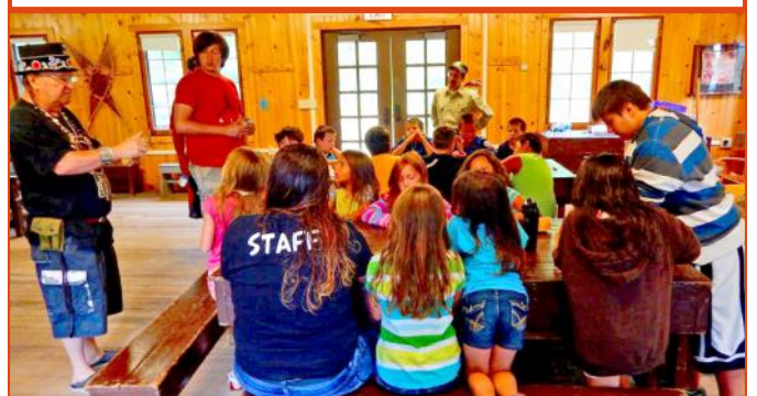
Participants were able to make up to four crafts which was held in the gathering room.