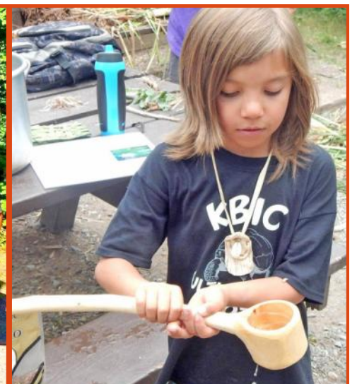
Cultural Camp 2015 participants enjoyed the four day event of participating and learning their culture and just having fun together.