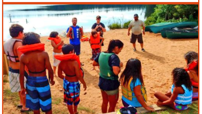
Participants learned water safety from GLIFWC, how to take a canoe out, and what to do if it tips over.