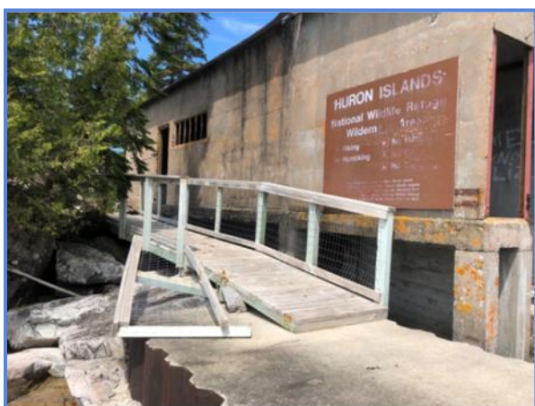
Broken and deteriorating infrastructure at the Huron Islands National Wildlife Refuge.