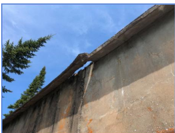
Deteriorating Boat House