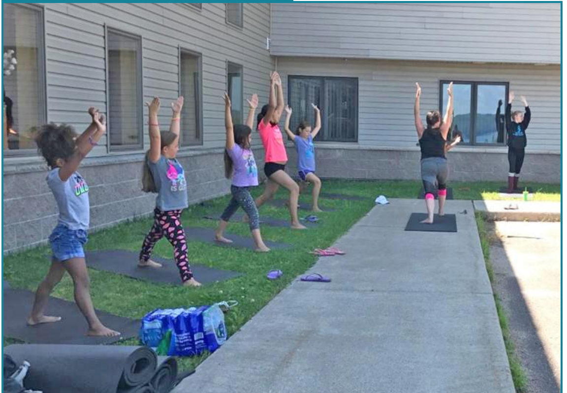
Group Yoga Session.