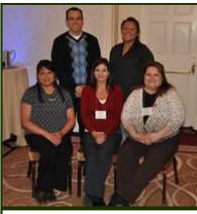
Tribal Health Department Beta Test Site Accreditation Coordinators and Representatives.

During the time period of fall 2009 until December 2010, 30 public health departments throughout the United States participated in a test of the national voluntary public health accreditation program. The goal of the public health accreditation program was to improve and protect the health of every community by advancing the quality and performance of public health departments. The Keweenaw Bay Indian Community was carefully selected with considerations that varied from size, structure, popula-