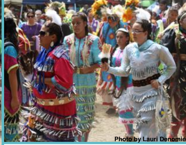
Above and below: Dancers at Sunday Grand Entry.