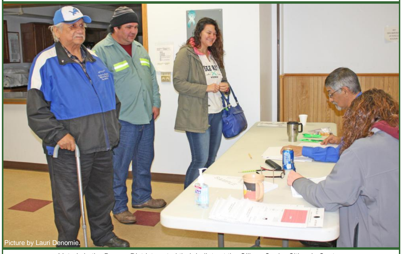
Voter's in the Baraga District casted their ballots at the Ojibwa Senior Citizen's Center.

The Keweenaw Bay Indian Community held the Primary Election on Saturday, October 31, 2015.