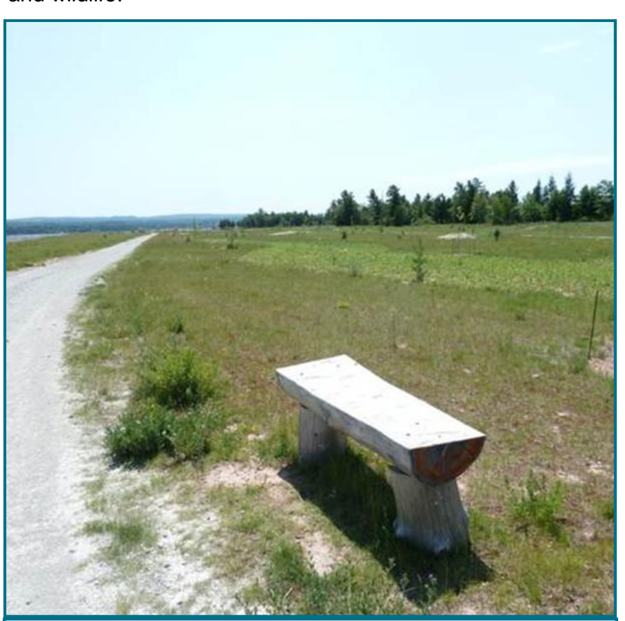
Bench along the walking trail at Sand Point.

Since 2006, the KBIC Natural Resources Department has been working to restore the Sand Point Site for wildlife, native plants, and recreational use. After several years of planting and monitoring, the improvements are noticeable. Natural Resource Department staff documented an increase in pollinators in the native plant "garden," and increased use of the area by song birds, geese, deer, turtles, and other wildlife. The fitness trail has also become a popular spot for walkers and joggers. A floating bridge was constructed in 2014 to connect the light house/camp group area to the walking trail at the Sand Point Restoration Site. Work will continue in 2015 to enhance the area for future generations of people and wildlife.