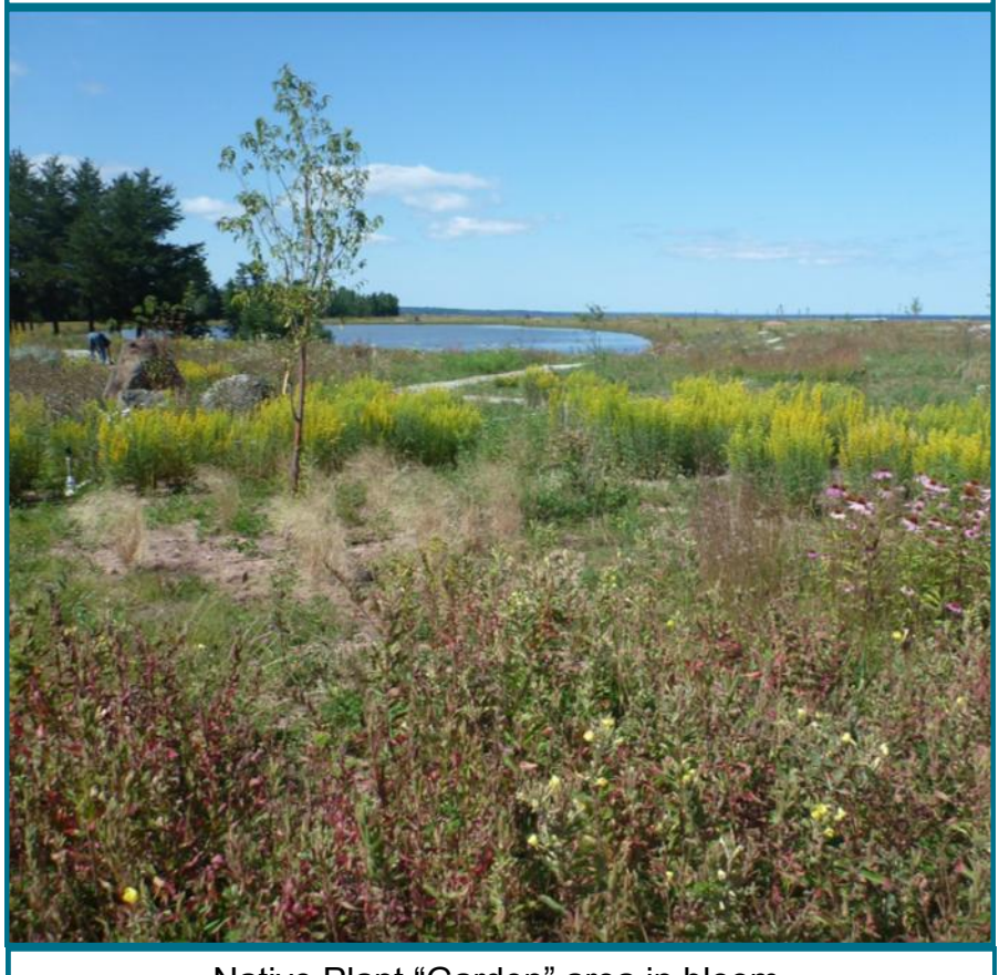
Native Plant "Garden" area in bloom.