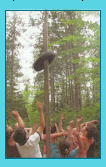
Natural Resource Cultural Summer Camp July 20-24, 2015

Camp Nesbit, Sidnaw, Michigan In the Ottawa National Forest